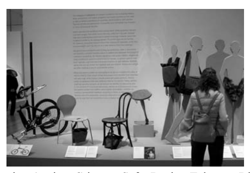
Figure 3. Design Against Crime at Safe: Design Takes on Risk, MoMA

The philosophy behind DAC as a practice led design research agenda is linked to the understanding that design should address security issues without compromising functionality, aesthetics or other forms of performance, i.e. the simple idea that "secure design doesn't have to look criminal or ugly". Our research projects attempt to think thief and to "... help designers keep up with the adaptive criminal in a changing world" (P. Ekblom 2000). This generative design approach has led to much innovation and many DAC design exhibitions from CSM at UoAL. Over the last five years a number of DAC objects have been presented to the international design arena, most recently at Safe: Design Takes on Risk – Museum of Modern Art, New York, 16 October 2005 – 2 January 2006 (Image 3).