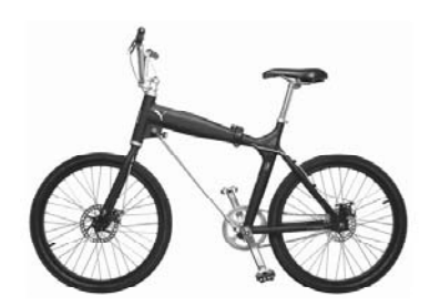
Figure 10. Puma Bike

The Vexed ambition to harness consumerism, via market intervention, to promote social change can be seen to be effective a decade later. Predominantly in the success of Vexed's Urban Mobility concept. As regards promoting urban transportation outside of the car socially the change has started to come and it is possible that Vexed's 'socially responsive' design activities have contributed. Vexed's contribution in this area is most apparent in the adoption, by Puma International AG, of Vexed's Urban Mobility agenda as a product category in 2003. This led to Vexed's proposal for an urban mobility bike integrating anti crime functionality (Image 9) being developed by Puma/Biomega and Vexed.